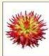
D. 'Julie's Delight'

Fully double blooms characterised by broad, generally sparse ray florets, either straight or slightly involute along their length giving a shallow appearance. Depth should be less than half the diameter of the bloom.