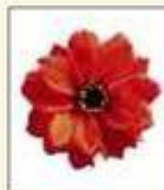
D. 'Bishop of Llandaff'

Fully double blooms showing no disc. The ray florets are generally broad and flat, or slightly twisted and usually bluntly pointed, and may be involute for no more than 75% of their length.