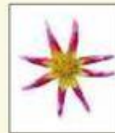
D. 'Juil's Allstar'

Fully double, spherical blooms of miniature size, not exceeding 50mm in diameter, with florets involute for the whole of their length.