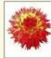
D. 'Anna Cozens'

Fully double blooms, ball shaped or slightly flattened. The ray florets are blunt or rounded at the tips, spirally arranged, with margins involute for at least 75% of the length of the florets.