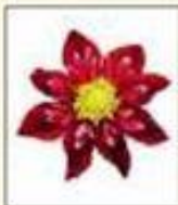
D. 'Don Hill'

Single outer ring of florets surrounding the disc. Ray florets are uniformly either involute or revolute.