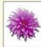
D. 'Mayan Pearl'

Fully double blooms, the ray florets are usually pointed, the majority narrow and revolute for 50% or more of their length and either straight or incurving.