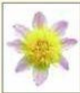
D. 'Ryecroft Marge'

Ray florets evenly split or notched into two or more divisions, uniformly throughout the bloom creating a fringed effect. Petals may be flat, involute, revolute, straight, incurving or twisted.