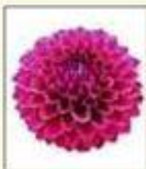
D. 'Dikara Midnight'

Fully double blooms, ray florets usually pointed, and revolute for more than 25% of their length and less than 50% of their length (longitudinal axis), broad at base and either straight or incurving.