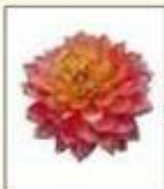
D. 'Charlie Dimmock'

Fully double blooms, showing no disc. Ray florets are narrowly lanceolate and either involute or revolute.