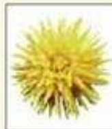
D. 'Lakeland Sunset'

A single outer ring of generally flat ray florets, which may overlap, with a ring of small florets (the collar), the centre forming a disc.