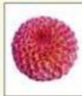
D. 'Will's Ringwood Rosie'

One or more outer rings of generally flattened ray florets surrounding a dense group of tubular florets, which are longer than the disc florets in Single dahlias, and showing no disc.